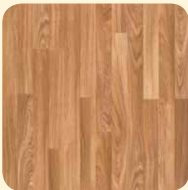
BRUSHBOX 2-STRIP CXF007