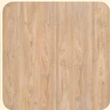
PLANKED NATURAL OAK CXF026