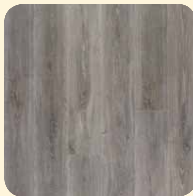
AUTHENTIC OAK LIGHT GREY CXF044