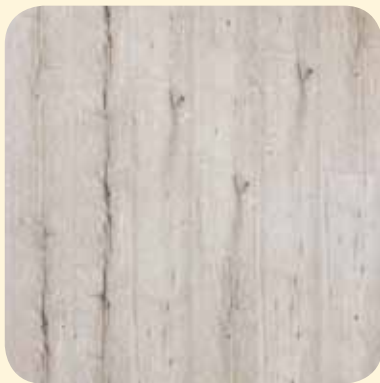
OLD OAK GREY BRUSHED CXF073