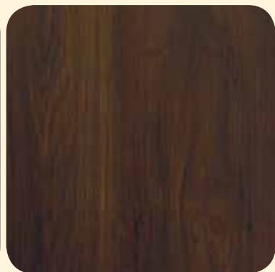
RUSTIC OAK DARK BROWN CXF053