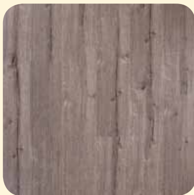
OLD OAK DARK GREY BRUSHED CXF074