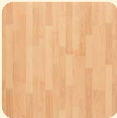
ENHANCED BEECH 3-STRIP CXF001