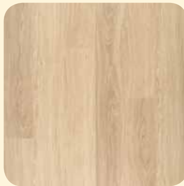
CLASSIC OAK WHITE VARNISHED CXF047